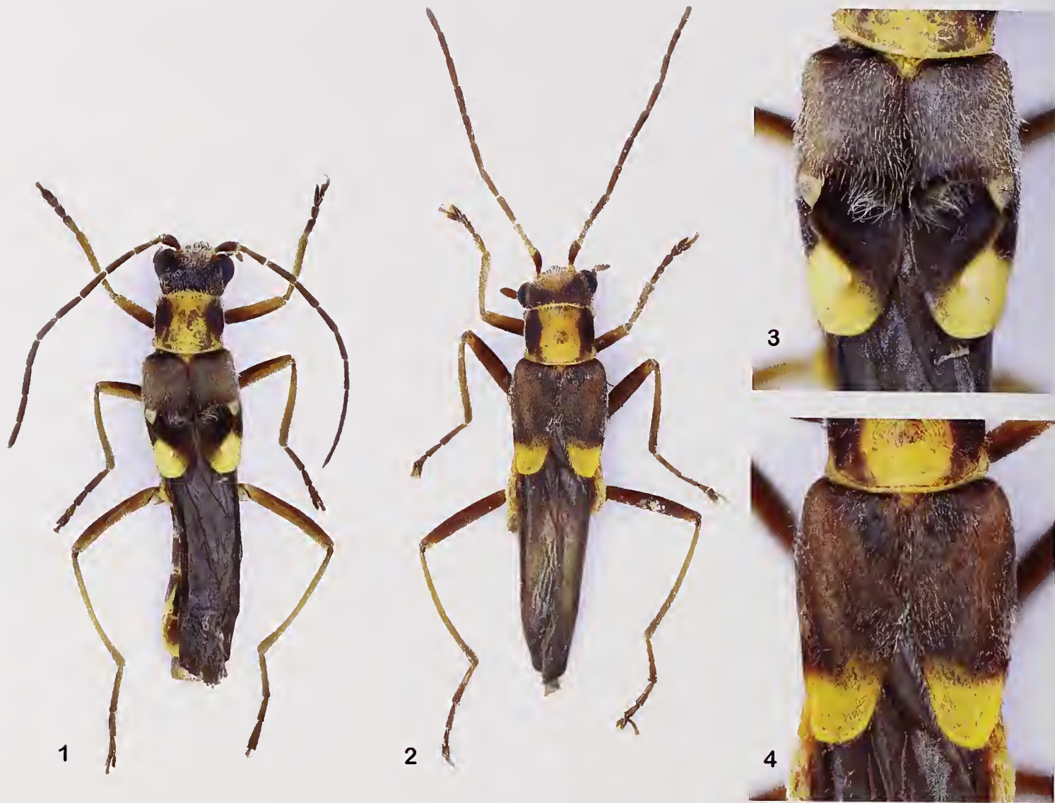
Figs 1-4. Paramaronius unituberculatus sp. nov. (1) Dorsal habitus of male (holotype, NMB). (2) Dorsal habitus of female (paratype, MZSP). (3) Detail of the elytra of male. (4) Detail of the elytra of female.

and legs light brown, darker on the dorsal surface of femora and pro- and mesothoracic tarsi. Abdomen dark brown, yellow on the margins of each ventrite and tergite; last ventrite completely brown.